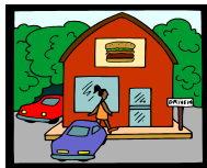
Britt’s Burger Barn